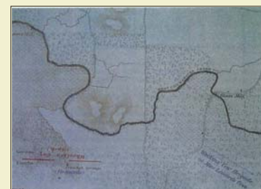
EVENING - SEPTEMBER 20, 1863

Please visit our website at: http://www.ChickamaugaCampaign.org