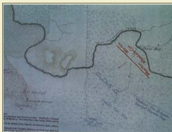
MORNING - SEPTEMBER 20, 1863