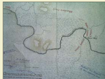
AFTERNOON - SEPTEMBER 20, 1863