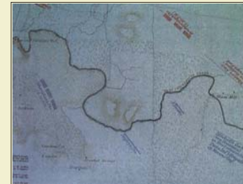
AFTERNOON - SEPTEMBER 19, 1863