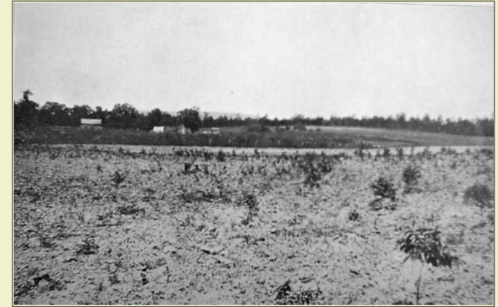
GLASS' MILL BATTLE SITE

confined to the batteries and the skirmishers, and continued about three hours, when Helm's Brigade was withdrawn to the east bank of the creek and marched towards the Confederate right. About 5 o'clock p.m. Beatty's Brigade was withdrawn to Crawfish Spring to join the rest of Negley's Division.