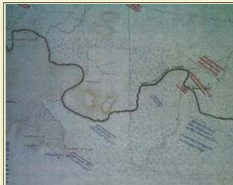
MORNING - SEPTEMBER 19, 1863