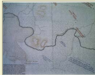
NOON - SEPTEMBER 19, 1863