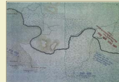
5:00 PM - SEPTEMBER 19, 1863