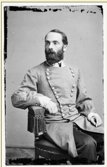
GENERAL JOE WHEELER

In late August 1863, the Federal Army of the Cumberland began moving toward Georgia. On the extreme right of the Federal lines, the XX Army Corps,