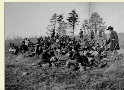
SOLDIERS TAKING A BREAK