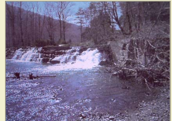
MILL DAM AND POND