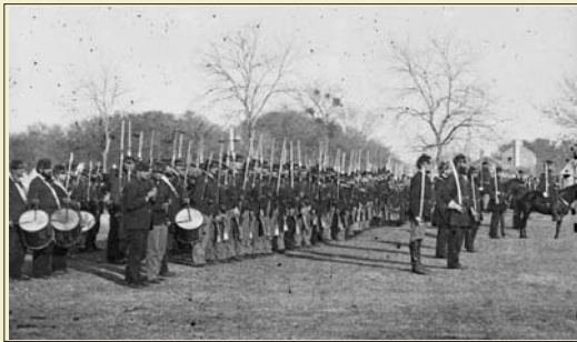
PREPARING TO MARCH