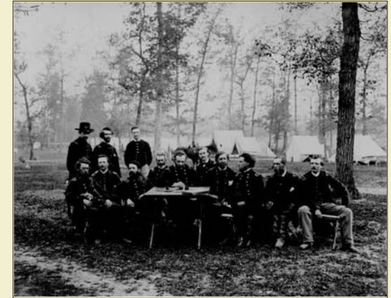
GENERAL THOMAS AND HIS STAFF IN THE FIELD

move. The roads were in bad shape and also congested. In some areas, units from other commands refused to move. It was 10:30 p.m. by the time Thomas reached Crawfish Spring. He moved Negley's division off the road at that point and instructed them to camp around the spring. He knew that it would take most of the night to march his men to the right of the army. It was obvious that the men would be in poor shape for combat in the morning after such a march. Nevertheless, he determined to make the best of the situation. He sent advance parties north along the Dry Valley road. They set fire to the rail fences on either side of the road to light and mark the way. Smoke from the fires mixed with the rising dust to sting the eyes and burn the throats of the marching soldiers. The column moved slowly, with frequent stops and starts. Whenever the men to the front would halt, those behind would drop to the dust, or rest in place, asleep on their feet. All night long it went on stopping and starting, stopping and starting all night to cover five miles. Dawn was approaching when they halted in the fields east of the Widow Glenn's farm.