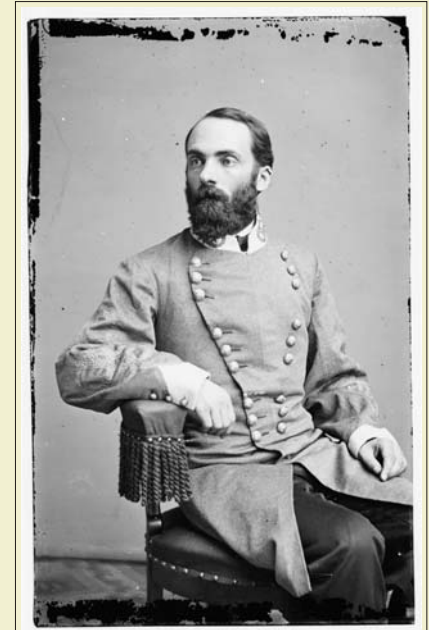
GENERAL JOE WHEELER

moved through Neal's Gap to the top of Lookout Mountain where it secured the Dougherty's Gap road into McLemore Cove until September 19th.