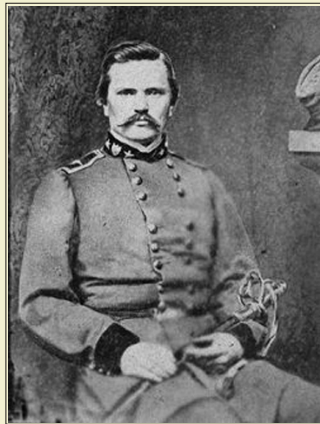
GENERAL SIMON BUCKNER

Pigeon Mountain is a rugged spur of Lookout Mountain, extending in a northeasterly direction into Walker